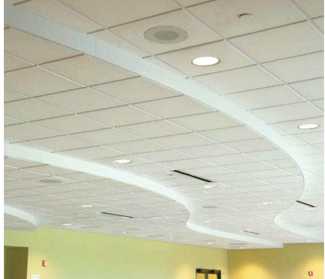
Product: CONTOUR® Ceiling Tiles Application: Cafeteria Architect: Turok Architecture, Inc.