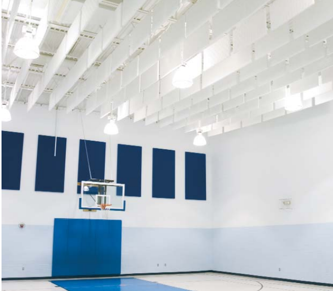
Product: SONEX® Baffles Application: Gymnasium