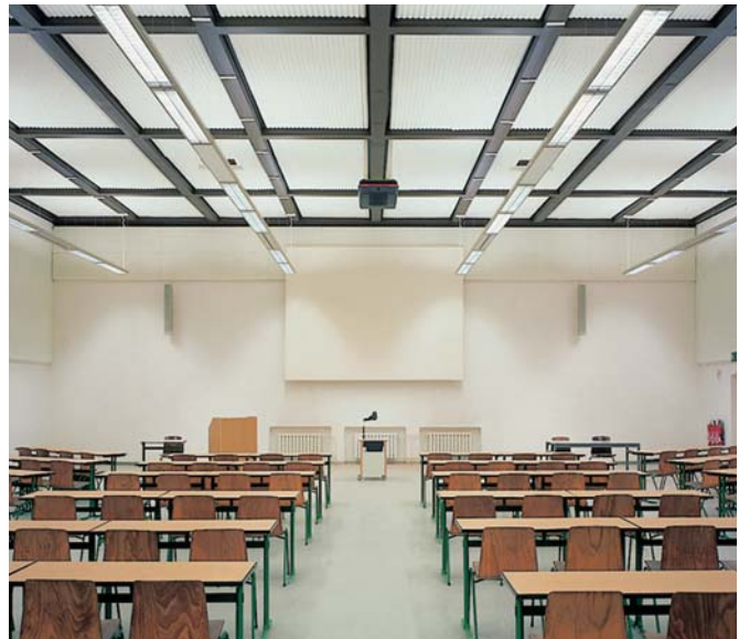
Product: WHITELINE® Ceiling Tiles Application: Lecture Hall

To learn more about these and other applications, visit our website at www.pinta-acoustic.com/applications_Schools.php